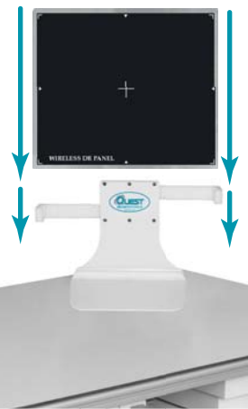
Shown with Wireless DR Panel In Landscape Position